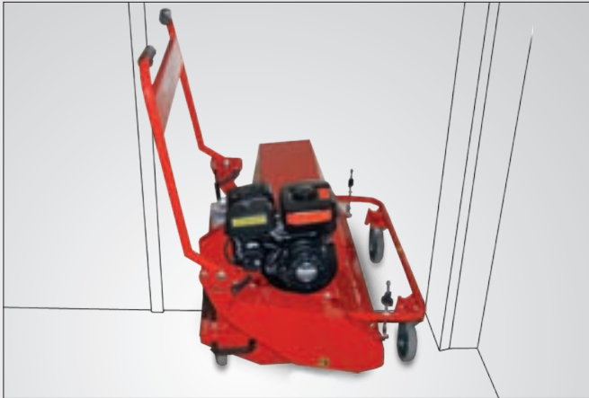
Easy moving through narrow doorways