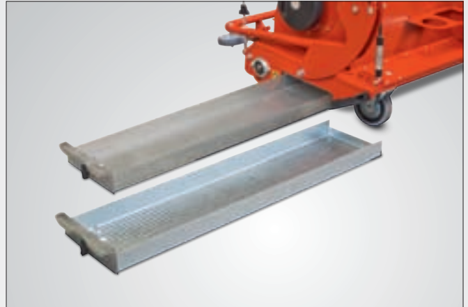
Extractable filter sieve several sieves available