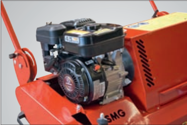
1-cylinder petrol engine for brush and turbine