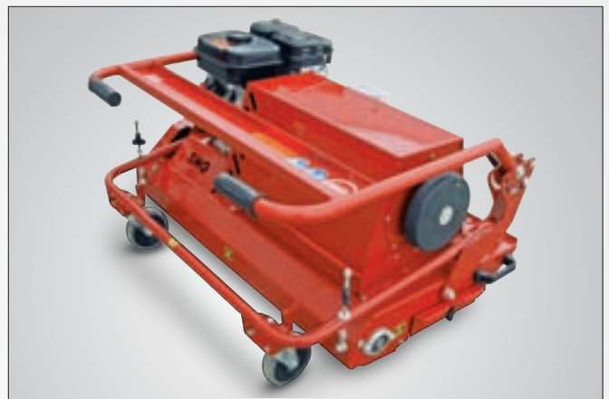
Foldable steering arm for easy transport and storing in a small place