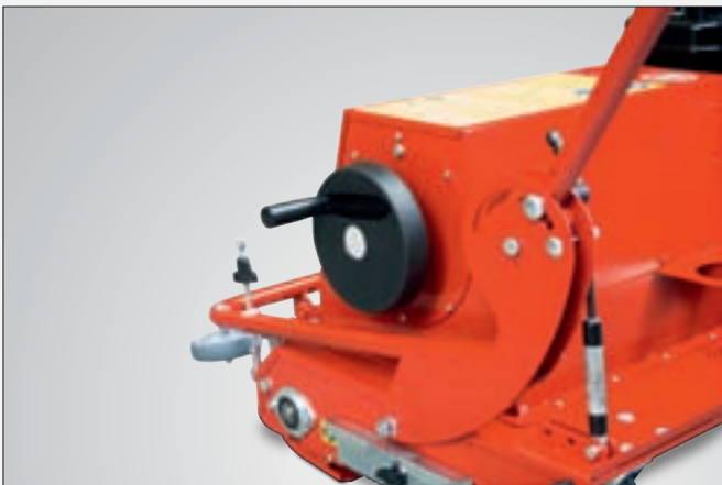
Hand wheel to clean the permanent filter