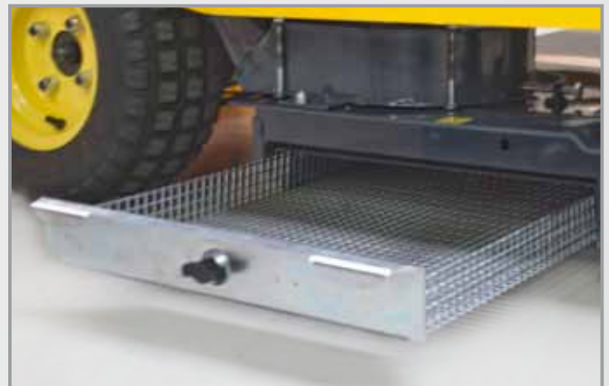
Adjustable sieve from 4 - 10 mm