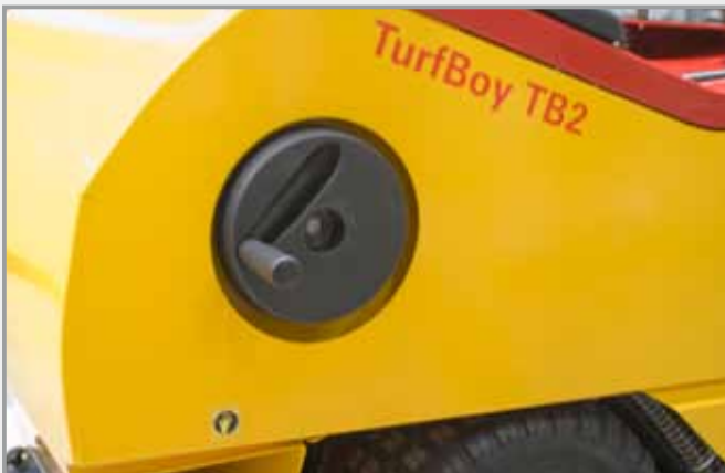
Hand wheel for dedusting of the permanent filter