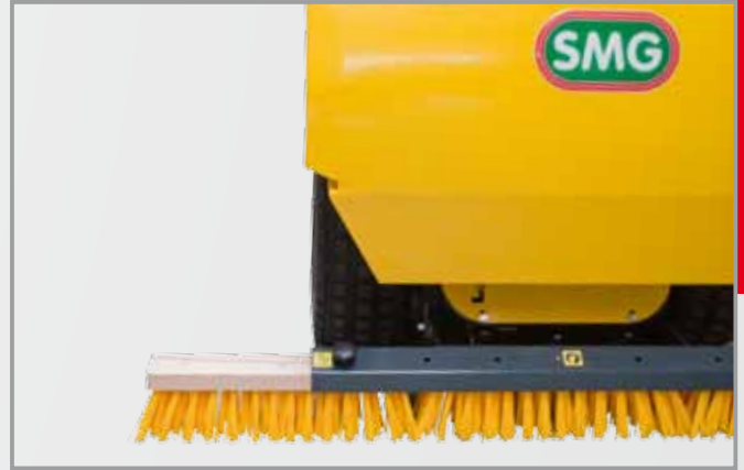
Left-side overlapped drag brush row