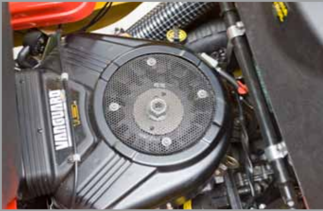
16 HP 2-cylinder petrol engine