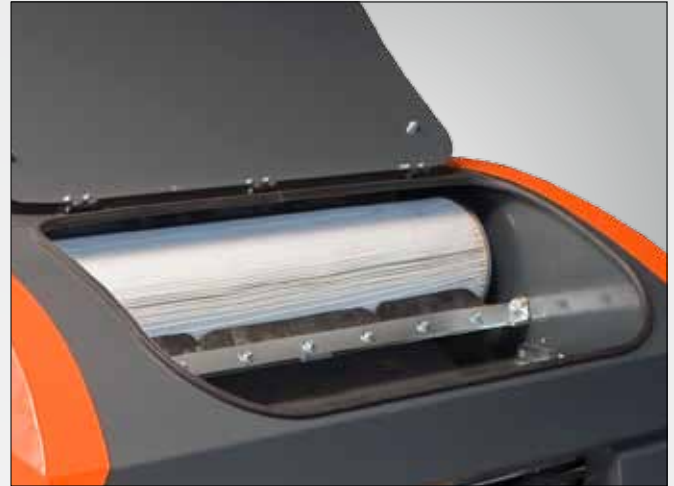
Permanent filter with continuous dedusting of filtered suspended particles