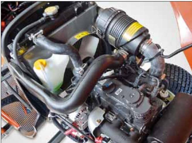
3 cylinder diesel engine, water-cooled 21 HP