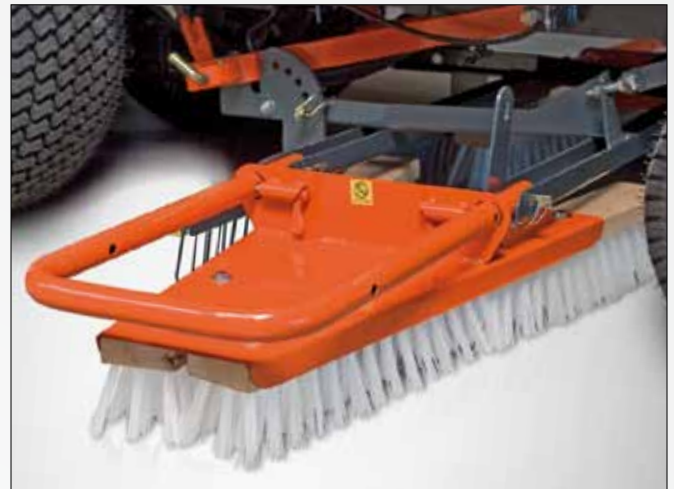
Drag brush for the maintenance process (2.400 mm)