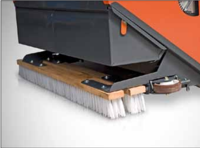
Rear-mount attachment with integrated rotary brush, drag brush, guide pulley and transport rollers